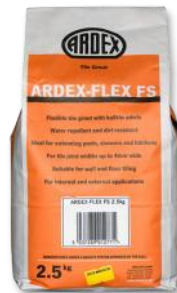
Float Pearl Grout Match Ardex FS Dove Grey