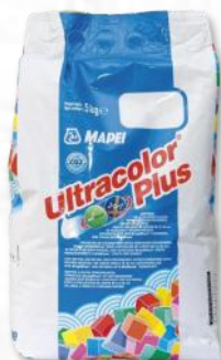
Float Mid Grey Grout Match Mapei Ultracolour 127