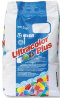
Float Sand Grout Match Mapei Ultracolour 123