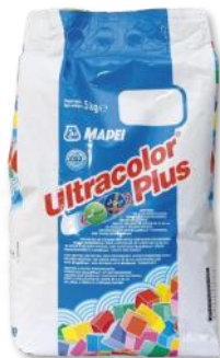
Float Ice Grout Match Mapei Ultracolour 103